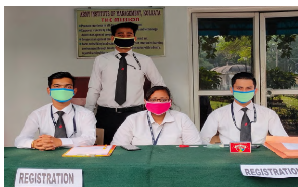
The Registration Desk established during the admission process of MBA-24 Batch (17 & 18 Mar)

8. Admission MBA 24 : Group Discussion (GD) / Personal Interview (PI) (17 & 18 Mar). GD & PI for 132 aspirants (Army : 102 & General : 30) for 120 seats (Army : 94, General : 24) were conducted on 17-18 Mar. Observance of CoVid-19 precautionary measures made conduct of GD & PI challenging. Certain changes were also made to the format to allay safety concerns. The online round for those candidates (14 candidates : Army-09, General-04) who could not report for GD & PI was scheduled on 26-27 Mar. Thus we have 1.22 applicants per seat this year as against 2.3 applicants per seat last year. This trend is disturbing and would have to be arrested.