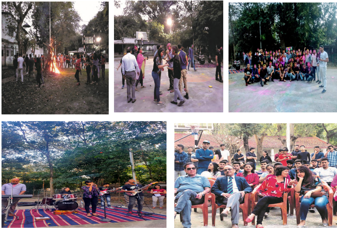
A collage of the Holi celebrations in the institute on 09 & 10 Mar